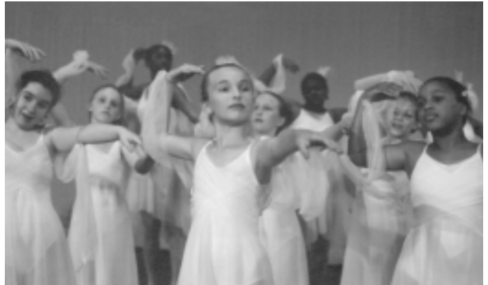
A student performance of the Children's Dance Foundation.

Children's Dance Foundation has grown to the point that we have gotten too large for our current location. We have purchased new property in downtown Homewood, which is currently under renovation. We hope to be finished by March of 2003, so that we can have more studio space for our growing programs. We are excited and grateful to the community that has made it possible.