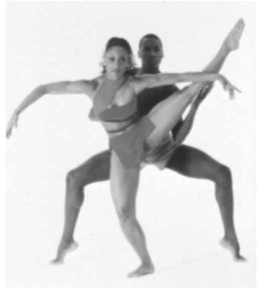
The Dayton Contemporary Dance Company will be in residence during the Alabama Dance Summit January 17-19, 2003. Continued on page 3