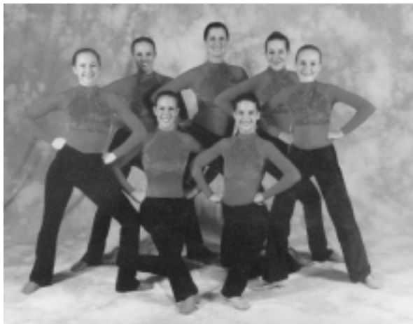
The Prattville Ballet