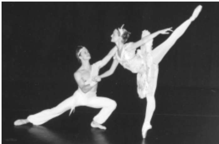
Alabama Dance Theatre will perform Act I of La Bayadere as part of its upcoming season.

In addition to public performances, ADT offers special