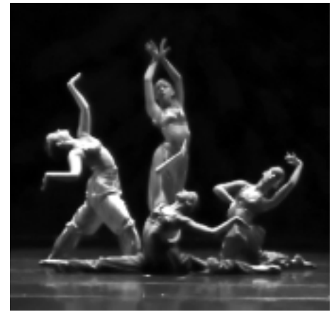
Three Kings is one of the dances featured in Alabama Dance Theatre's Christmas performance, Mistletoe.

Mistletoe , an annual holiday production at the Davis Theatre for the Performing Arts. Performance times are November 15 at 7:30 p.m. and November 16-17 at 2:00 p.m. Tickets on sale after October 22 at 334-241-2800.