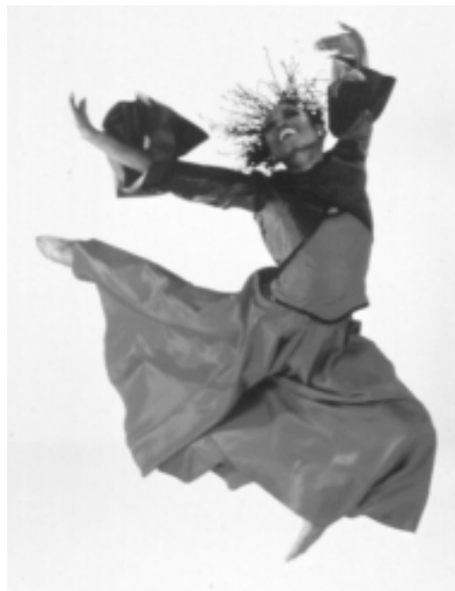
Staff of the Dayton Contemporary Dance Company will teach classes in the modern repertory, marking a new dimension for learning at the Summit.